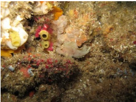
Paper fish

We would like to thank the many new diving faces that have joined us, especially over the December period. We had a bumper December and it was loads of fun. To all of you, it has been great to meet you and to dive with you and hope to see you again soon. To all our regular "friends" that have been diving with us, it has been wonderful to spend time with you again and we look forward to more amazing dives and sightings with you on the boat.