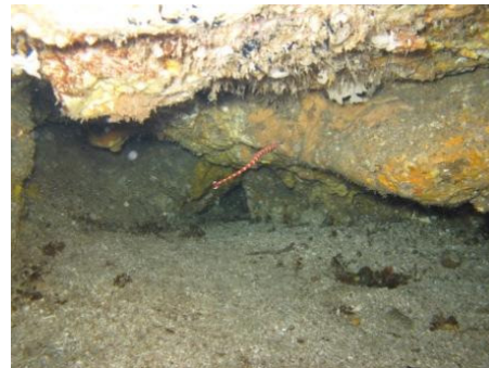
Banded Pipefish